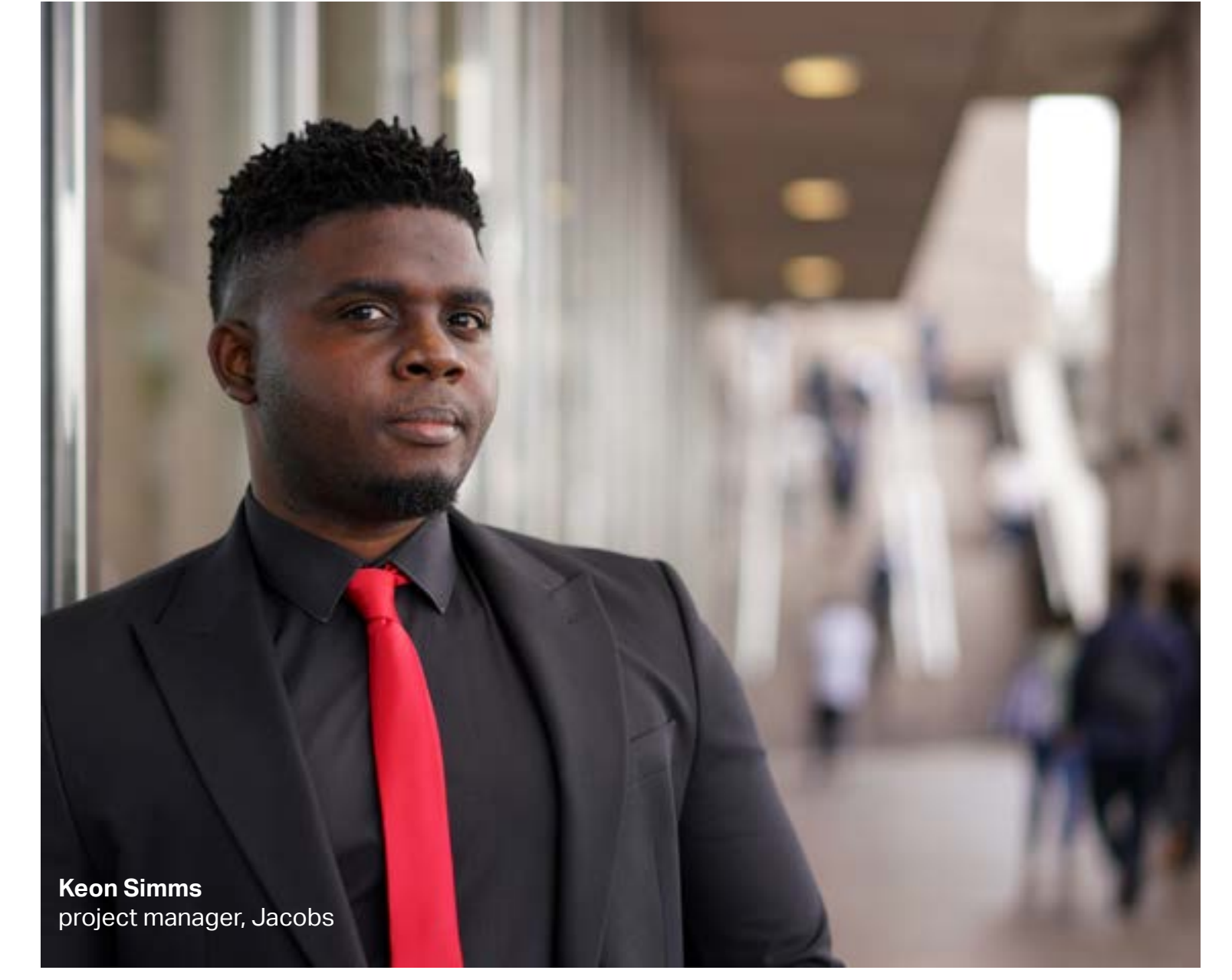
photography ©Luke Agbaimoni